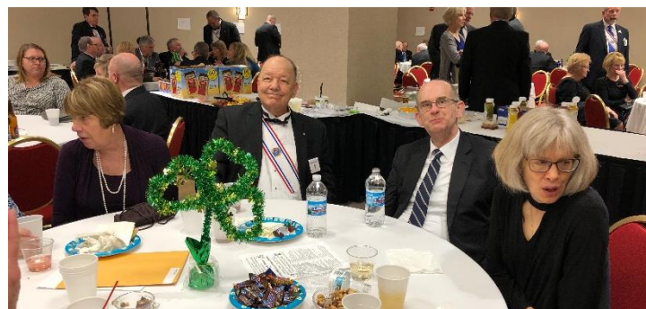
Relaxing in the hospitality room